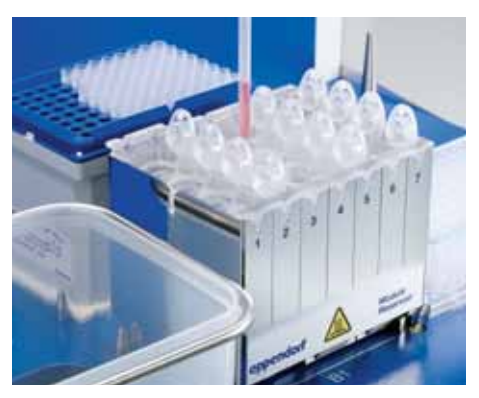
Easy integration in the ep Motion automated pipetting system