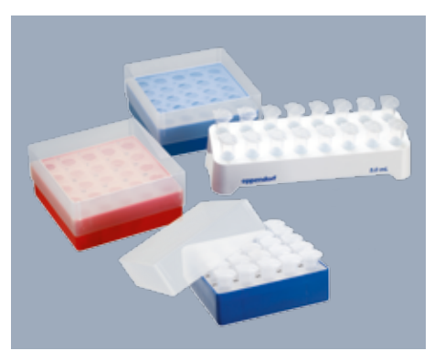
The ideal solution for sample preparation and storage: new racks and storage boxes