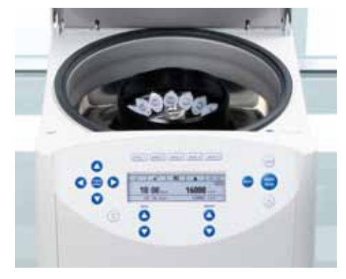
Safe centrifugation with Eppendorf Centrifuges