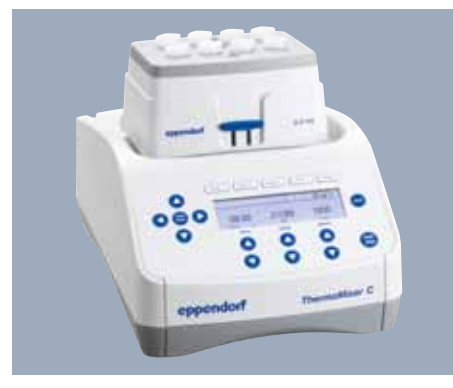
Perfect mixing, heating and cooling with the ThermoMixer C