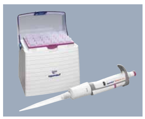
Precise one-step pipetting with Eppendorf pipettes and epT.I.P.S.® 5.0 mL